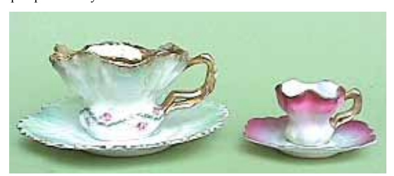
Cup (above) marked with RS Prussia Wreath and Star

We are aware of six different mold patterns used for miniatures, but there could easily be more. We show them here, and in some cases, the corresponding demitasse cup and saucer in the same tableware pattern. Most of the patterns were made in the 1905-1910 period. We know this because corresponding demitasse size cups are often marked with the RS Prussia Wreath and Star trademark. Only on rare occasions can this mark be found on miniature size cups.