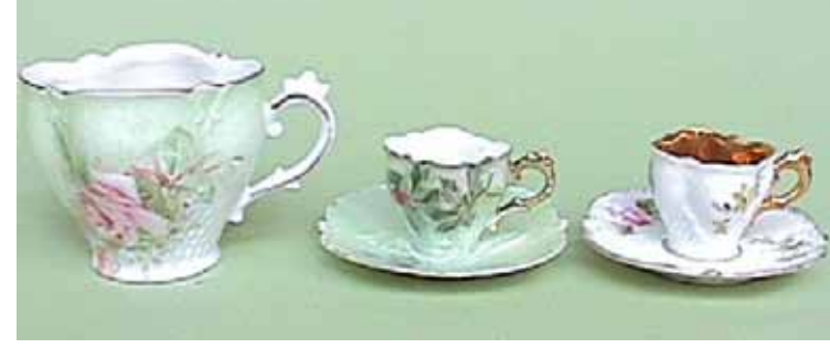
Cup (above) marked with RS Prussia Wreath and Star